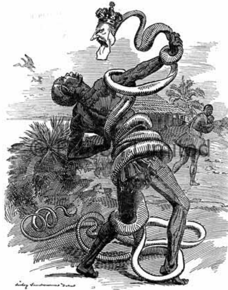
IN THE RUBBER COILS.

“It was just robbery with violence, aggravated murder on a great scale, and men going at it blind—as is very proper for those who tackle a darkness. The conquest of earth, which mostly means the taking it away from those who have a different complexion or slightly flatter noses than ourselves, is not a pretty thing when you look into it too much. What redeems it is the idea only. An idea at the back of it; not a sentimental pretence but an idea; and an unselfish belief in the idea—something you can set up, and bow down before, and offer a sacrifice to...” (1956)